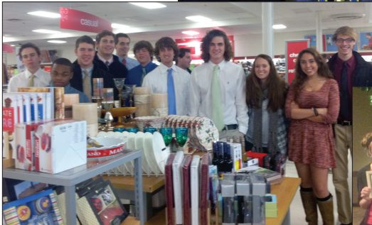
[LEFT] Marketing students at TJ Maxx; [RIGHT] Students at Mock DECA contest held at the Nia Center at Kalahari