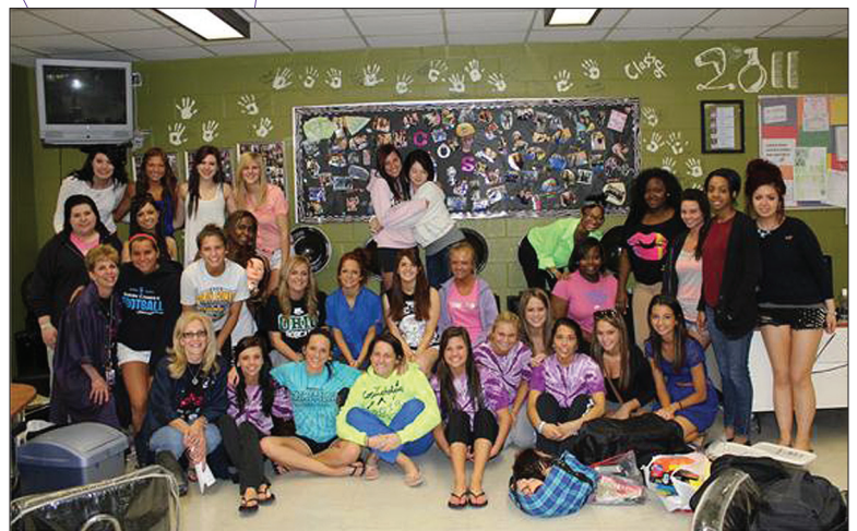
Cosmetology seniors prepare for their trip to Columbus for State Boards

As the school year comes to an end we would like to thank everyone who has supported our program. We could not do it if it wasn't for everyone's support. Our customer clinic is closed for the year but will reopen after Labor Day. We hope everyone has a safe and enjoyable summer.