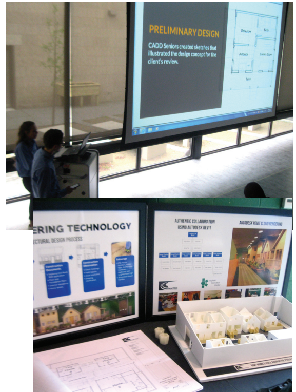
ABOVE: CADD students present design and process at the start of the Open House; CADD display at Construction Trades Open House