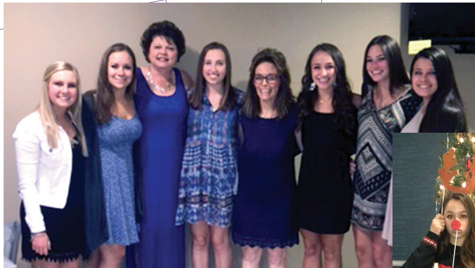
[ABOVE] Medical Technologies students at their Senior Banquet;