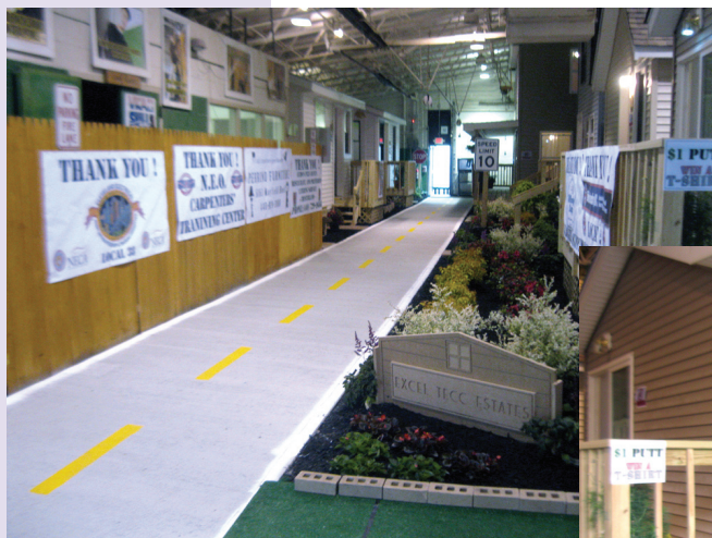
BELOW: Photos from Construction Trades 'Neighborhood Street' themed Open House