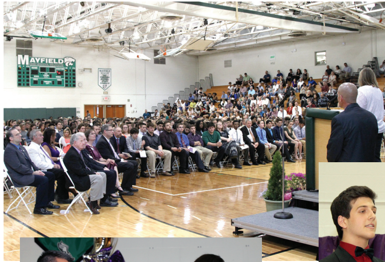
LEFT TOP: Overview of graduating students [center on floor] and guests at ceremony