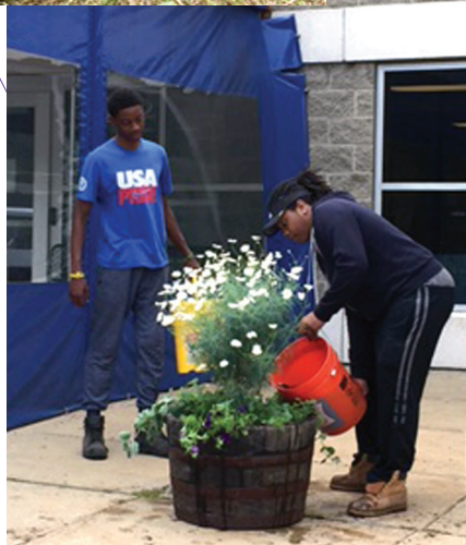
Photos this page: Students at work on the Gates Mills Center property and Mayfield high school