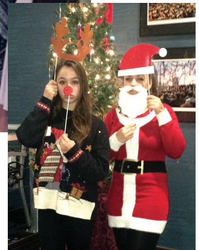
[RIGHT] Medical Technologies students at Upside of Downs in December