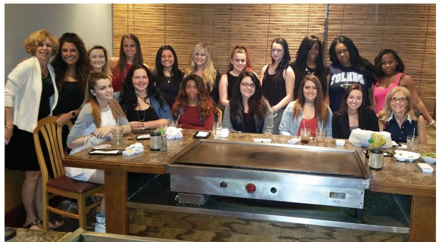
Cosmetology students celebrate!