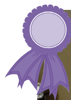
RIGHT: Award winner Nya

The Bistro will re-open next October with a new batch of young chefs! Be sure to patronize and see what wonderful food these students produce. Look us up on the Beachwood city schools website www.beachwoodschoools.org .