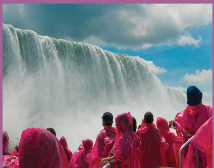
Top: Chicago, Bottom: Niagara Falls