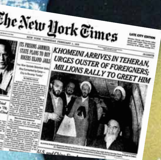
AYATOLLAH KHOMEINI , shown recently on a mural in Tehran, turned Iran into a theocracy.