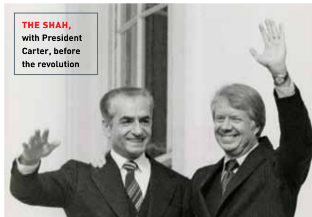
THE SHAH, with President Carter, before the revolution

To many Iranians, this was welcome progress, but to many