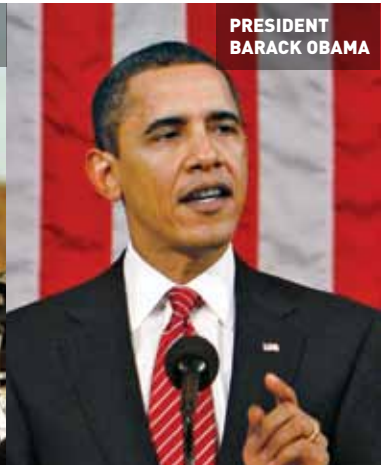
PRESIDENT BARACK OBAMA