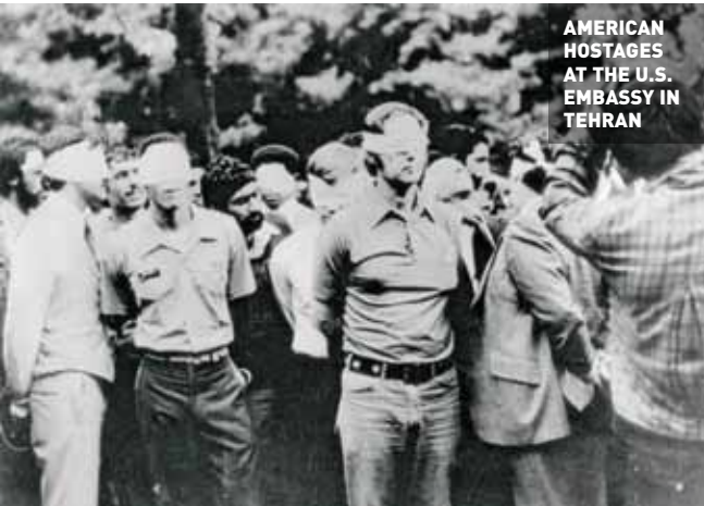
AMERICAN HOSTAGES AT THE U.S. EMBASSY IN TEHRAN