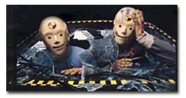
Vince and Larry, U.S. Department of Transportation crash test dummies, have been used in ad campaigns encouraging motorists to wear seatbelts and discouraging drunk driving. The Department of Transportation is instrumental in enforcing regulations regarding automobiles, railroads, and aviation.

About 90% of all federal bureaucrats are hired under regulations of the civil service system. Most of them take a written examination administered by the Office of Personnel Management (OPM) and they meet selection criteria, such as training, education levels, or prior experience. Some of them take special tests and meet special criteria, such as postal employees, FBI agents, CIA intelligence officers, foreign-service officers, and doctors in the Public Health Service.