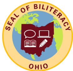
State Seal of Biliteracy