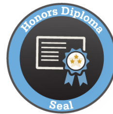
Honors Diploma Seal