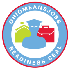
Ohio Means Jobs Readiness Seal