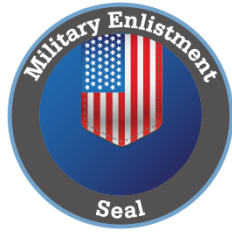
Military Enlistment Seal