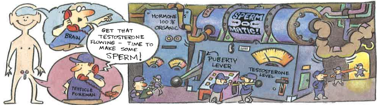
At puberty the brain tells the testicles to produce testosterone and sperm.