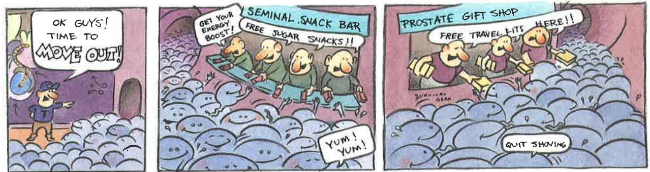
through the vas deferens, past the seminal vesicles and prostate gland,