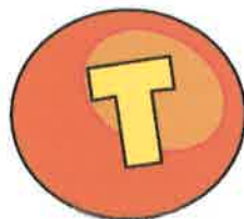
Helper T cell

Mission: To destroy infected body cells before the virus has a chance to multiply.